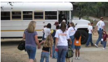
The Camp Bus