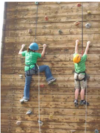
Climbing up to.....