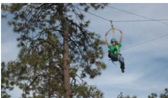
...the Zip Line!